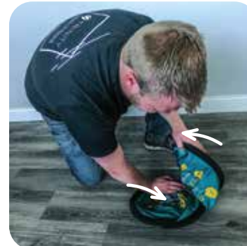
STEP 5. Twist & fold down the right side and pull up the left side