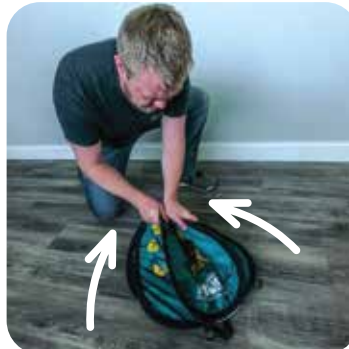
STEP 4. Fold in half again, making sure to hold onto each side