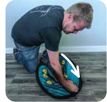
STEP 3. Press down on pop-out