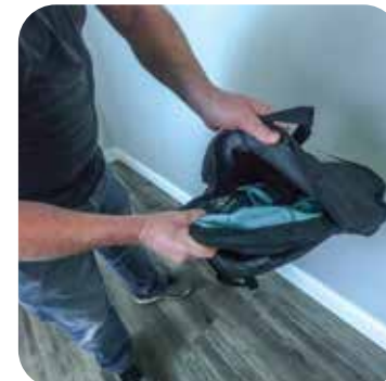
STEP 8. Place into carry bag