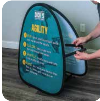
STEP 1. Unvelcro each side