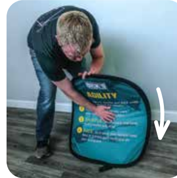
STEP 2. Fold in Half Horizontally